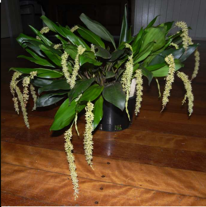
Dendrochilum aff. convallariiforme 'Yellow'