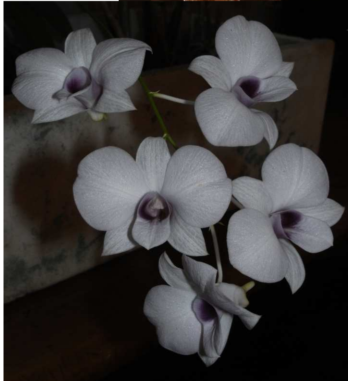
Dendrobium bigibbum (‘Blue Horizon’ x ‘Blue’) x ‘Blue Coral’