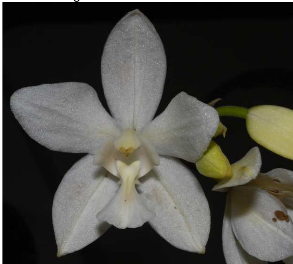
Spathoglottis sp. New Guinea