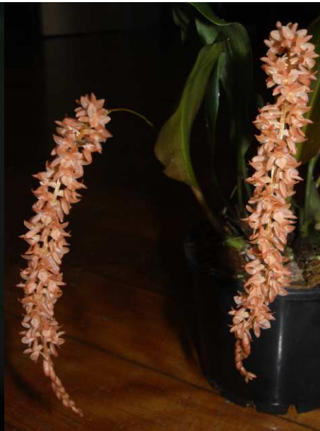
Dendrochilum convallariiforme var. convallariiforme