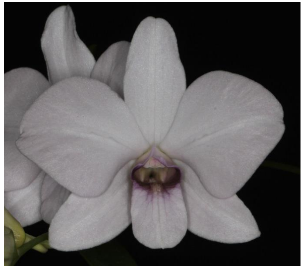
Dendrobium bigibbum var. superbum 'Blue Coral' × self