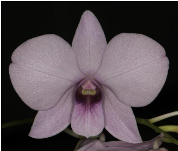
Dendrobium bigibbum var. superbum ( 'Blue Horizon' × 'Blue' ) × 'Blue Coral'