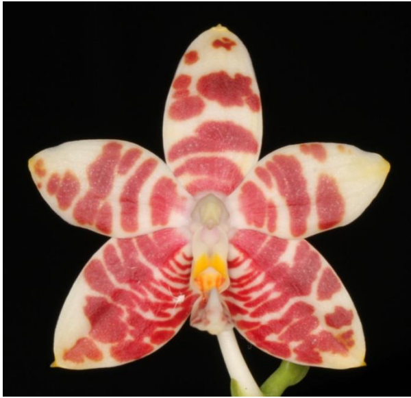
Phalaenopsis amboinensis var. flavida Currently considered by the World Checklist of Selected Plant Families to be a homotypic synonym of Phalaenopsis amboinensis