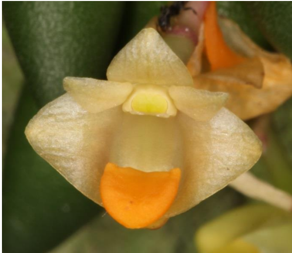
Dendrobium prenticei Currently considered by the World Checklist of Selected Plant Families to be a homotypic synonym of Dendrobium lichenastrum

Orchid commentary courtesy of Roger Finn