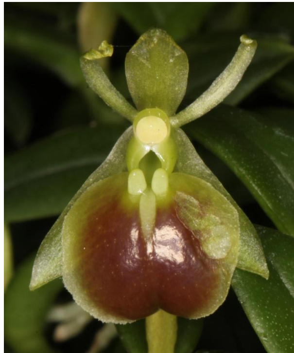
Neolehmannia porpax Currently considered by the World Checklist of Selected Plant Families to be a homotypic synonym of Epidendrum porpax