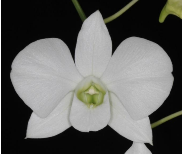
Dendrobium bigibbum var. album